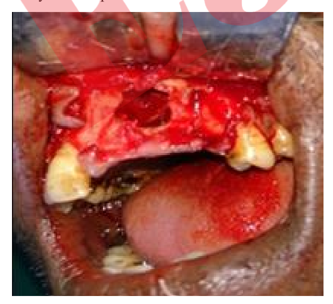
Fig 2: Operative

Crevicular incision was taken from left maxillary central incisor to left maxillary canine and then releasing incision was taken distal to left maxillary central incisor and left maxillary canine Mucoperiosteal Flap was raised. Bony window was made in the left lateral incisor region. The borders of the cyst were separated from bone and was enucleated.