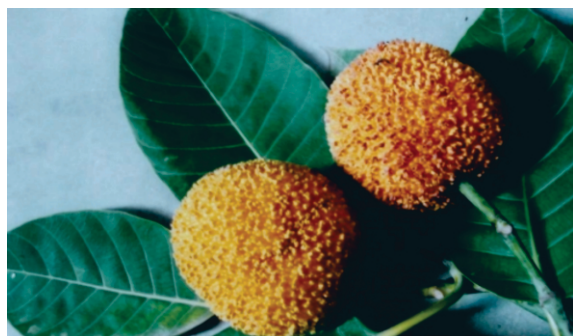
Fruits of A. indicus

In Raja Nighantu, three kinds of Kadamba are mentioned namely, dhara kadamba that is the kadamba described above, dhuli kadamba – which blooms in the spring and bhumi kadamba- which has small flowers. The roots, fruits, leaves, bark skins are used for medicinal purposes. Externally the wounds and ulcers are dressed with its leaves (slightly wormed) in alleviate the pain swelling and for cleansing and better healing of wounds. The decoction of the leaves is also used for this purpose. The juice of bark in combined with cumin seeds and sugar alleviates vomiting. The excessive thirst in fevers, quenched with its fruit juice. Kadamba is rewarding in skin diseases as it improves the complexion of the skin. In burning sensation of the body and fever, the bark skin is commonly used. The bark skin and the fruits are salubrious in general debility. (21-33)