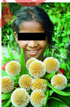
Flowers of A. indicus