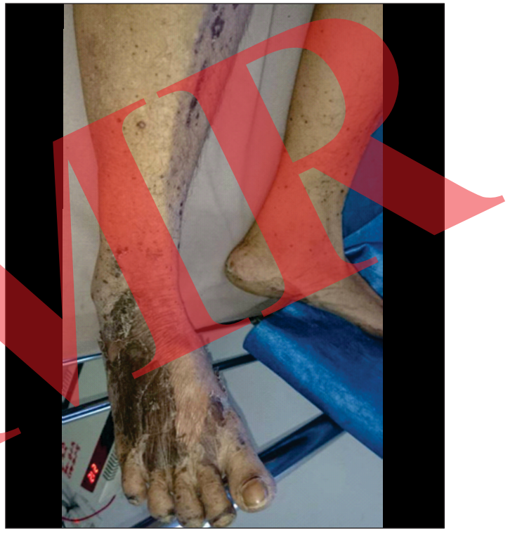
Figure 3: Crusting seen in lower limb

Gradually the condition of the patient improved and after 2 days, crusting of rashes, bullae and blisters started developing and edema, erythem aand itching subsided. (Figure 3)