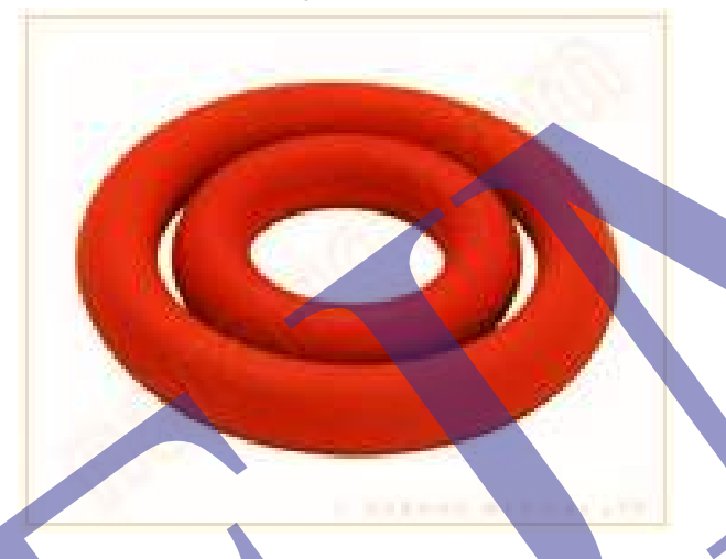
Figure 3- shows different size of vaginal pessary

USG examination- revealed gestational age of 29 weeks 5 days, estimated fetal weight 1.452kg, adequate liquor, and grade 1 upper uterine segment placenta. The ring vaginal pessary applied to keep uterus inside pelvis after manual reposition and patient was discharged after advising Kegel's perineal exercise and avoidance of heavy physical activity or weight bearing. The patient missed her next scheduled antenatal visit and was lost to follow up.