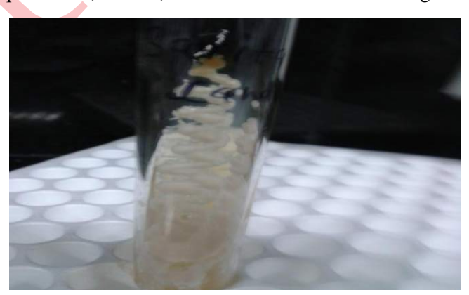
Fig: Showing growth on Sabouruads Dextrose Agar Medium

After preliminary investigations, serum creatinine, potassium, sodium, and urea were found to be deranged.