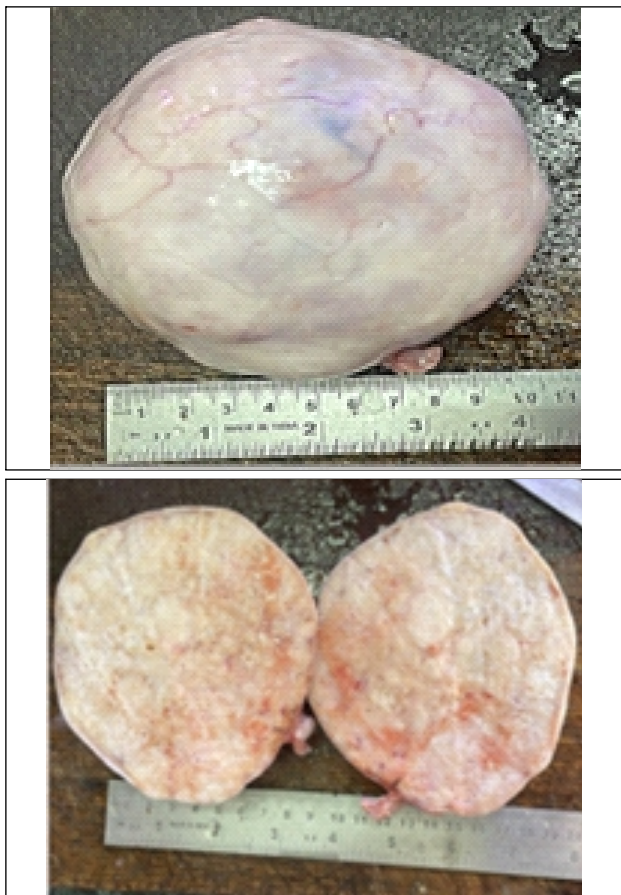
Fig. 1. Gross Appearance of Tumor-asingle well Encapsulated, Solid, Globular, Bosselated Gray White Soft Tissue with Rubbery Consistency Measures 10.5X8X6CM cut surface shows Grayish White to Yellow Solid areas.

Patient taken for exploratory laparotomy, while operating, a large firm mass arising from right ovary of approx. 10x8x8cm with right fallopian attached to it was found. Uterus, left ovary and fallopian tubes found healthy. No per op finding suggestive of malignancy found. Peritoneal wash sends for cytology. Decision of TAH with BSO taken and performed. Grossly the tumor was 10.5x 8 x 6 cm sizes with well encapsulated, solid, bosselated gray white, with rubbery consistency. Cut surface showed grayish white to yellowish solid areas. Histopathology report- section from right ovarian tissue suggestive of Brenner Tumour. Left ovary, uterus and both tubes were unremarkable.